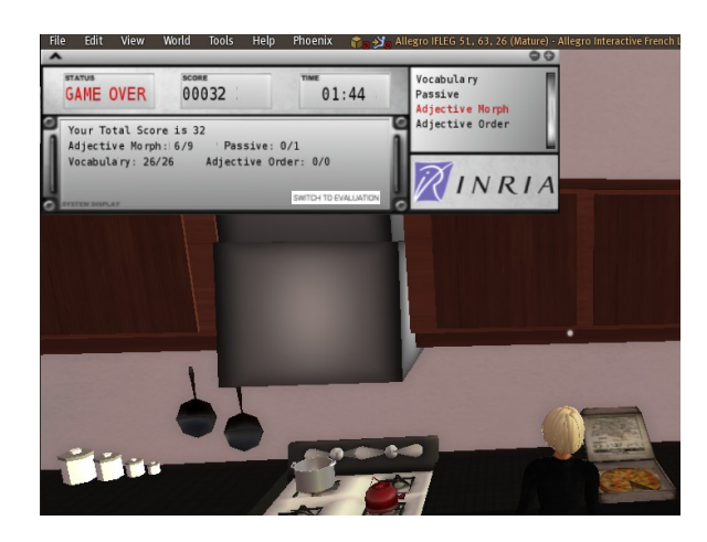
Figure 7. The final score

The same input by an intermediate learner will score no point however as will an input by a beginner which fails on the current teaching goal such as here, "Jean est un garcon petit" where the "adjective order" exercise is incorrectly handled by the learner.