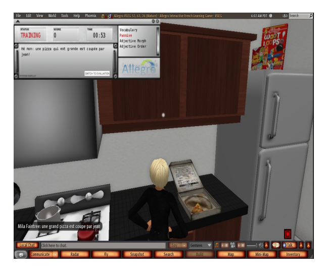
Figure 6. Example of user/system interaction during the training phase.

the learner input against one or more expected answers (targets) allowing for minor deviations such as differences in capitalization, determiner definiteness and punctuation. Although this is obviously limited, the training activities currently proposed are sufficiently constrained for the error detection mechanism to be adequate. Using this mechanism, the system provides the learner with two types of feedback namely, a verbal and a numerical feedback. The verbal feedback indicates whether the answer given by the learner is correct or not. In case it is not, the target answer is displayed thereby giving the learner the correct solution.