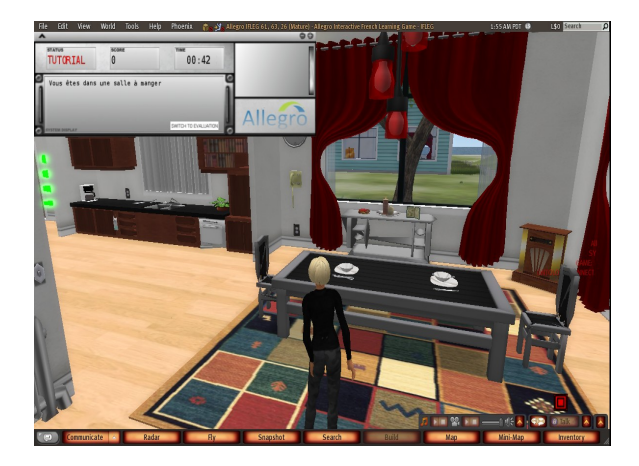
Figure 5. Example of tutorial interaction.

NLG module to generate exercises thus defining the grammatical coverage of the system. In the A1 level, the grammar used is restricted to cover the most basic syntactic constructions. This coverage then increases with the level of the learner.