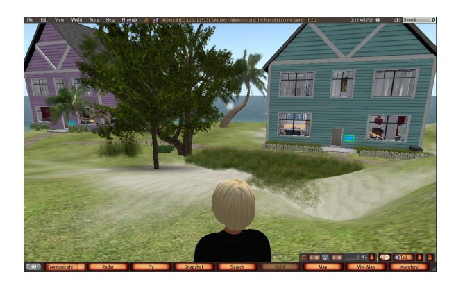
Figure 1. The I-FLEG Island.

A first person perspective is used whereby the learner is an avatar that can freely move in the game world. In order to start the game, she enters one of the houses where she can then interact with the 3D world by clicking on objects and entering text in a chat box.