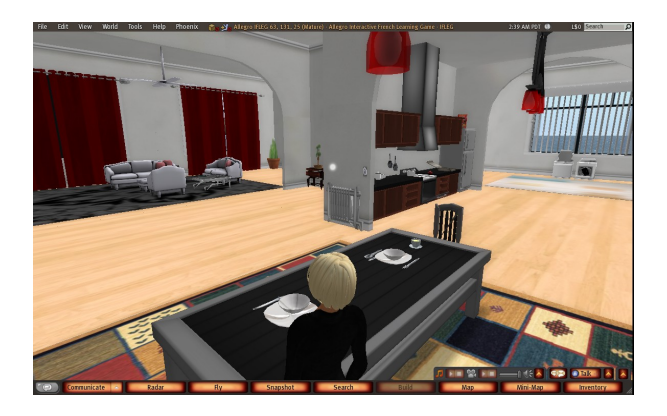
Figure 2. The interior of an I-FLEG house.

The game responds through messages displayed in the Head-Up Display (HUD, Figure 3) which acts as a virtual tutor guiding the player throughout the game. The upper part of the HUD shows information about the current state of the game, the score of the player and the elapsed time. The main window in the center of the HUD is used for guiding the navigation of the learner through the game world, for communicating learning exercises to the learner, and for conveying feedback information. The menu on the right lists the grammar topics (also called teaching goals) that can be exercised in a given