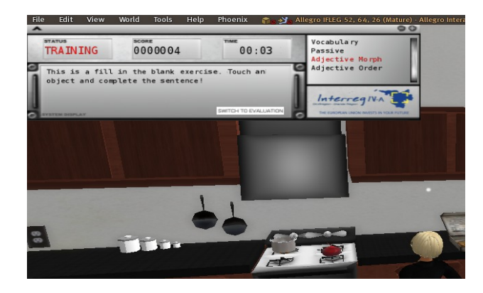
Figure 3. I-FLEG Game Hud.

We differentiate between the navigational instructions generated by the system to guide the user through the different phases of the game and the system feedback on learner input. The system uses English as a language for guiding the user though the game and for explaining training activities but French, the target language, for feedback messages and error correction.