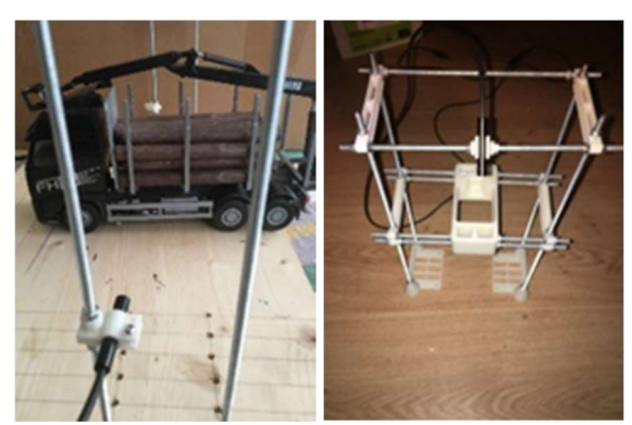
Fig.2. Testing measurement line prototype

By performing camera and lighting tests in laboratory conditions, the obtained raw data from video files were analyzed with video file analysis software to determine the best layout of cameras and lighting location in field conditions as well as the necessary dimensions of the measuring arch. In the tests were used six small cameras that were located at both sides of the log and wood chips transportation vehicle and at the top of measuring arch, see Fig. 2.