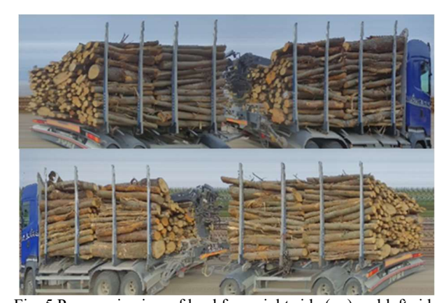
Fig. 5 Panoramic view of load from right side (up) and left side (down)

Images shown in Fig. 6 is for measuring the diameter of logs and width of load.