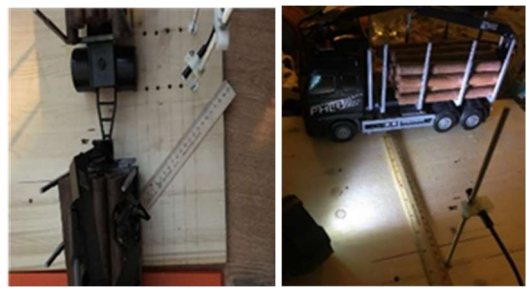
Fig.1 Examples of the cameras location detection

transport vehicle models the required arches dimensions were determined using the relationships of trigonometric functions (Fig. 1).