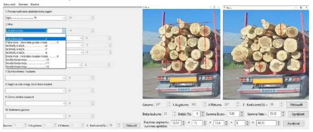
Fig. 9 Graphic User Interface Screenshots

In general, the GUI was developed with the possibility to choose between two types of the loads (logs or wood chips), overall concept of the measurement process in both cases is realized in very similar manner. It was made with purpose to make trainings of the involved stuff easier and logically related. Both types of the measurements have integration of inner measurement standards of the partner for load quality (each of them consists of at least from 20 different quality coefficients which affects the volume of useful load).