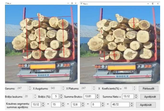
Fig. 10 Example of the geometric measurement process in GUI

Example of the measurement process of log load is shown in Fig. 10.