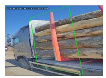
Fig. 8 Allocation of ROI in video images

In the presented case, the raw data is obtained from the cameras which are placed at the angles defined by the prototype. In order to create the panoramic image correctly, the transformation images for each camera must be identified to ensure data processing. The image of the transformation is determined by marking four points in the video. In each of the video images a region of interest (ROI) is allocated, which includes the height of the load of truck and about 2 m in width, see Fig. 8. Selected images should contain overlapping information. In the frame created on the image it is transformed accordingly.