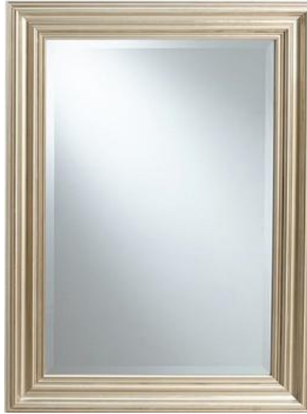
Figure 5: What are your core values?

For humanity's fate, you decide before that occurs