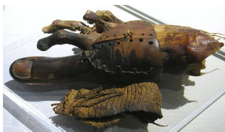
Figure 1: Towards transhumanism – prosthetic toe (circa 1550-1000 BC) found in Sheikh 'Abd el-Qurna (Prosthesis, 2021)

"Interdisciplinary" is a university salespersons' "good draw". Perhaps more so is "Cybernetics", updated to the popular "artificial intelligence" and transhumanism, steps beyond the industrial roboticization ongoing in earnest for over 250 years. We presently seek not only to replace human slaves (unpaid and wage) with artificial devices but apply the process to ourselves. Indeed, searching for "transhumanism" shows the most recent versions emerging from its origins several thousand years ago with Egypt's artificial toe. These are the mechanics, the import of which is vacuous without insight about intent.