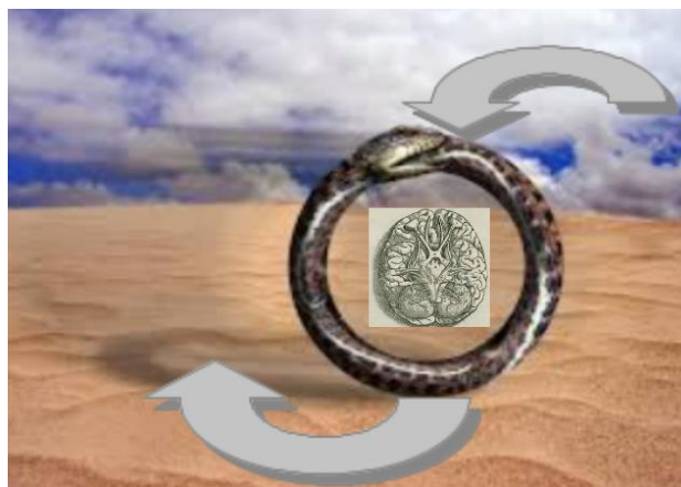
Figure 4: Welcome to sociointelligence!

To have a "discipline" you need an area of study, but the larger question is what "study" is and why we do it. I propose sociointelligence, the following image capturing the idea and about which I elaborate in the book.