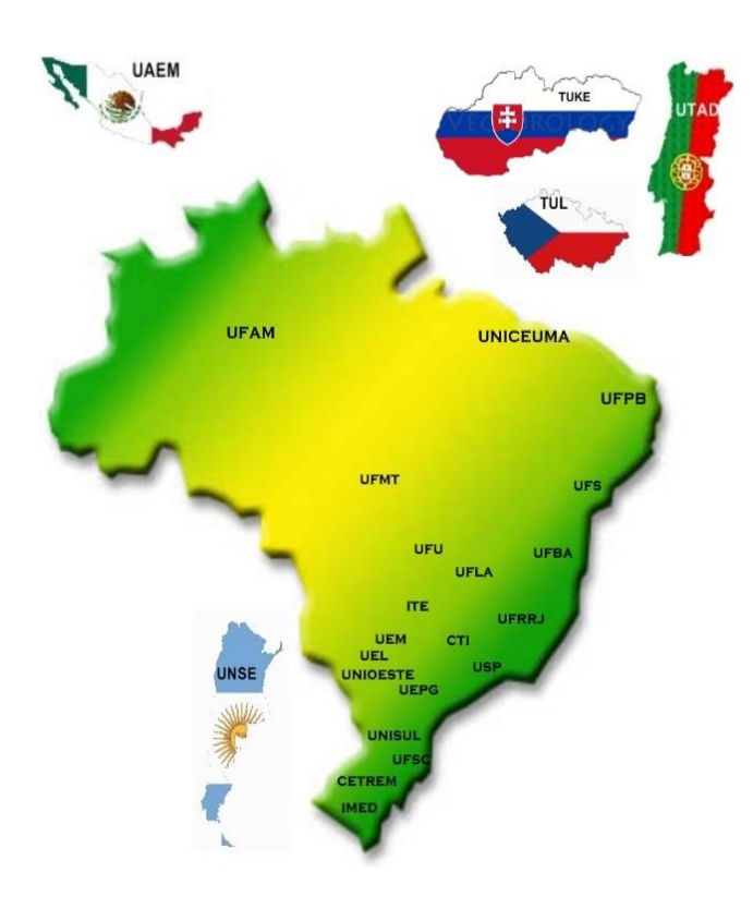
Figure 3 – Geographical distribution of the participating universities. At each Local identified on the map, the PQ [8,9] should be applied in at least five (5) hospitals. The goal is to reach about one hundred universities in this research project. There is no distinction on the kind of hospital, see reference [1.B]. The universities showed above means the ones where the research has been concluded. This Figure3: a courtesy from Prof. Dr. Ruy Ferreira/UFMT/MT.

The figure 3 shows the five major Brazilians regions (geographical distribution of participating institutions) where the research has been concluded (PQ application). Also presents the others countries where the research was finished.