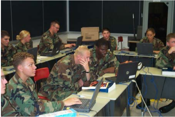
FIGURE 4: CADETS WATCHING NETWORK TRAFFIC USING SNIFFERS

operations. During these lessons, cadets learn about the tools and techniques used to conduct an information system attack, and the tools and techniques used to prevent these attacks. Cadets work with firewalls, network sniffers, and a network intrusion detection system (Figure 4).