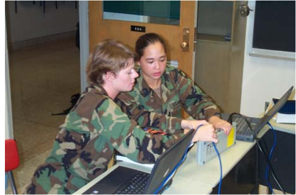
FIGURE 3: CADETS BUILDING CLIENT-SERVER NETWORK

During this five-lesson module, cadets review the principles of processing on computers, including the hardware and software involved with processing data into information. In the first lesson, cadets learn the principles of the hardware of a computer and the different file systems used on a computer. During the second lesson, cadets are given the opportunity to disassemble a PC, reviewing what each component does and then put it back together. Two lessons are spent learning about databases, getting hands-on experience with Microsoft